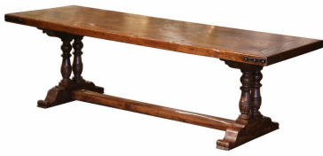
Vintage French Carved Chestnut & Oak Trestle Dining Table from the Pyrenees