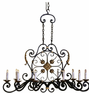
Early 20th Century French Louis XV Painted and Gilt Iron Ten-Light Chandelier