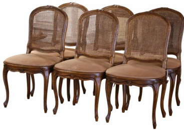
19th Century French Louis XV Carved Walnut and Cane Dining Chairs, Set of Six