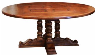
Mid-Century French Carved Walnut Pedestal Round Dining Table with Parquetry Top