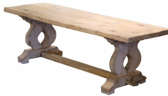
18th Century French Louis XIII Carved Bleached Oak Refectory Trestle Table