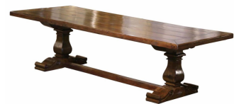
Vintage French Carved Walnut Monastery Refractory Trestle Table