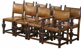
19th Century Carved Oak and Leather Dining Sidechairs & Armchairs, Set of 8