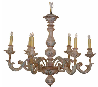
19th Century French Napoleon III Carved Polychrome & Painted 5-Light Chandelier